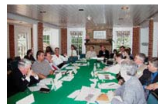
CAC Meeting on FDOT Project

For Plan Updates and General Information: http://www.sgrdc.com/Bike%20and%20Ped/